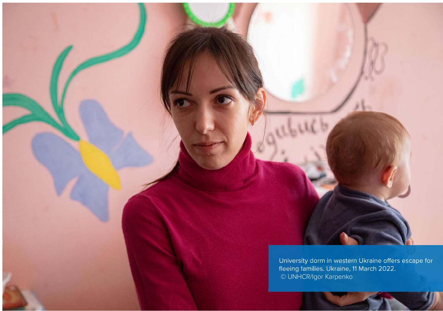
University dorm in western Ukraine offers escape for fleeing families. Ukraine, 11 March 2022.